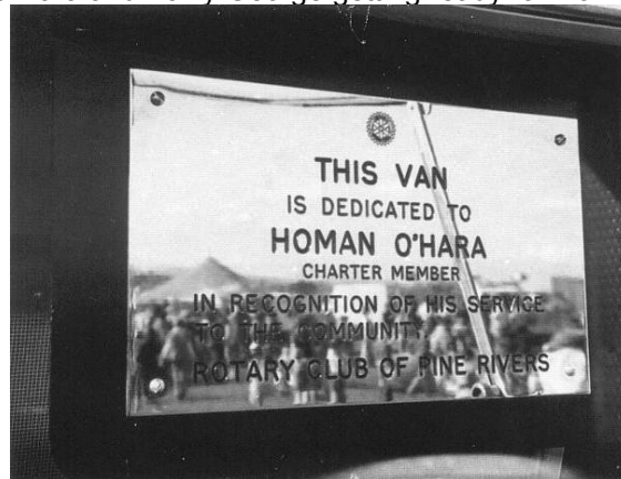
Plaque placed in the van, dedicating it to Homan O'Hara.