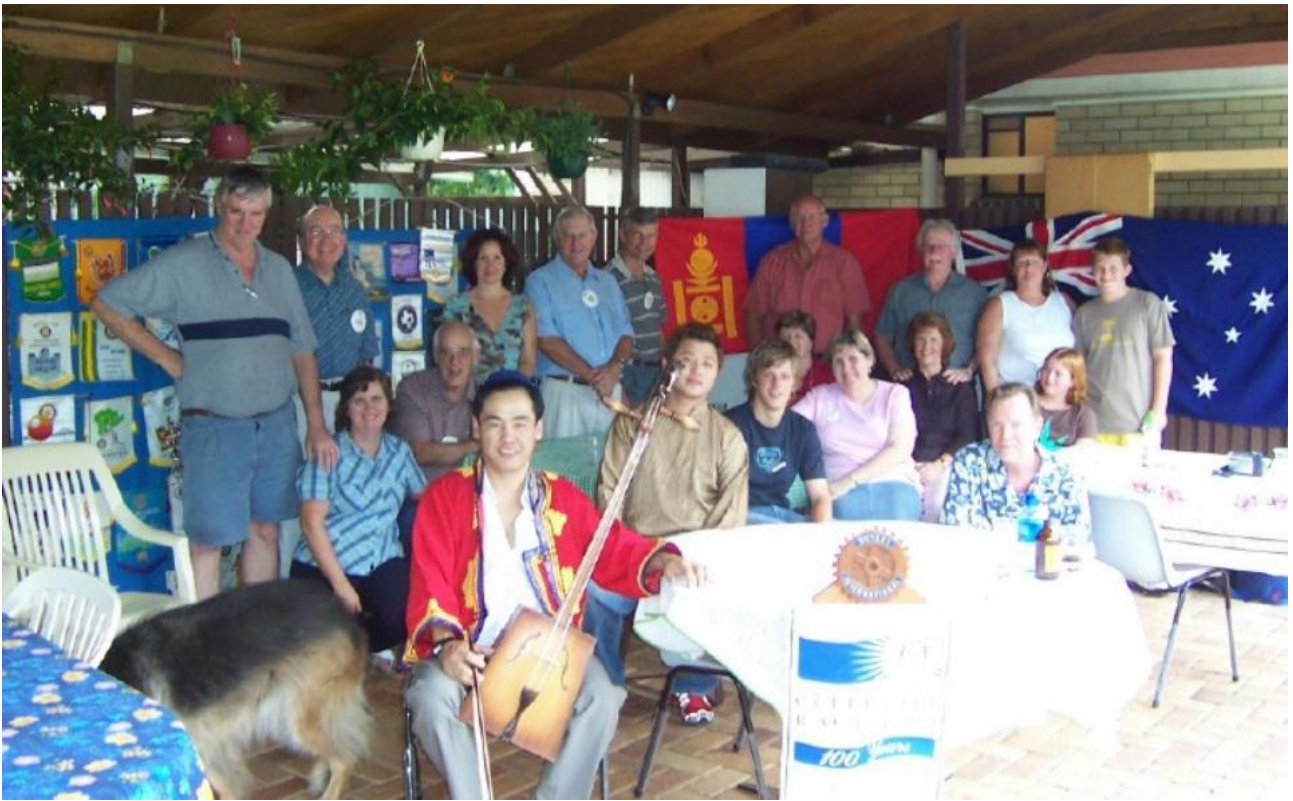
Gathering to honour our Ambassadorial Scholar