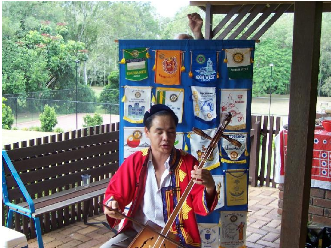
Mongolian Throat Singer