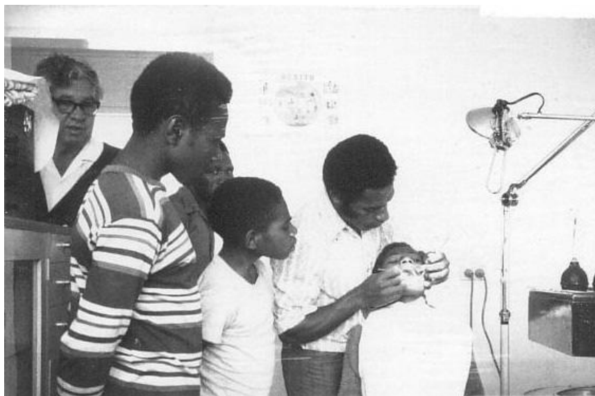
Dental clinic at Goroka. Club sponsored in 1967-68

The spray painting of the roof of the Marsden Boys Home complex was another task completed by club members.