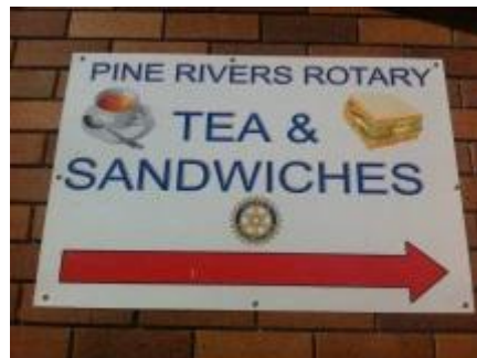
Our show kiosk is a winner