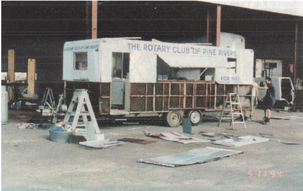
Pull it apart to make a new one.