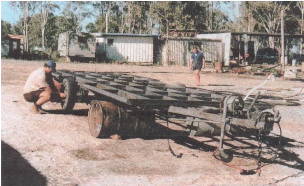
Work on the chassis at Ken Young's property.