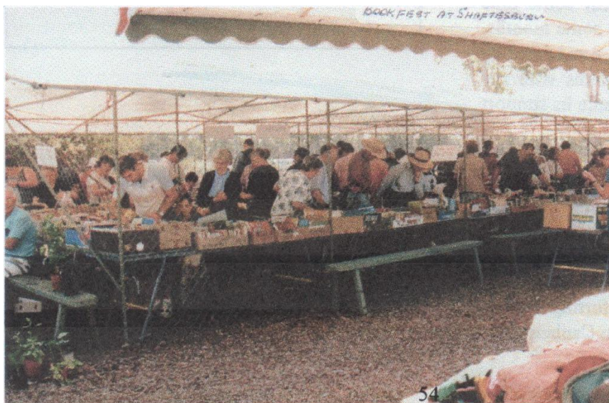
The bookfests at Shaftesbury have been rewarding in many ways.

Thanks to some more fine work by our Rotaryannes, a lovely Progressive Dinner was enjoyed by us all.