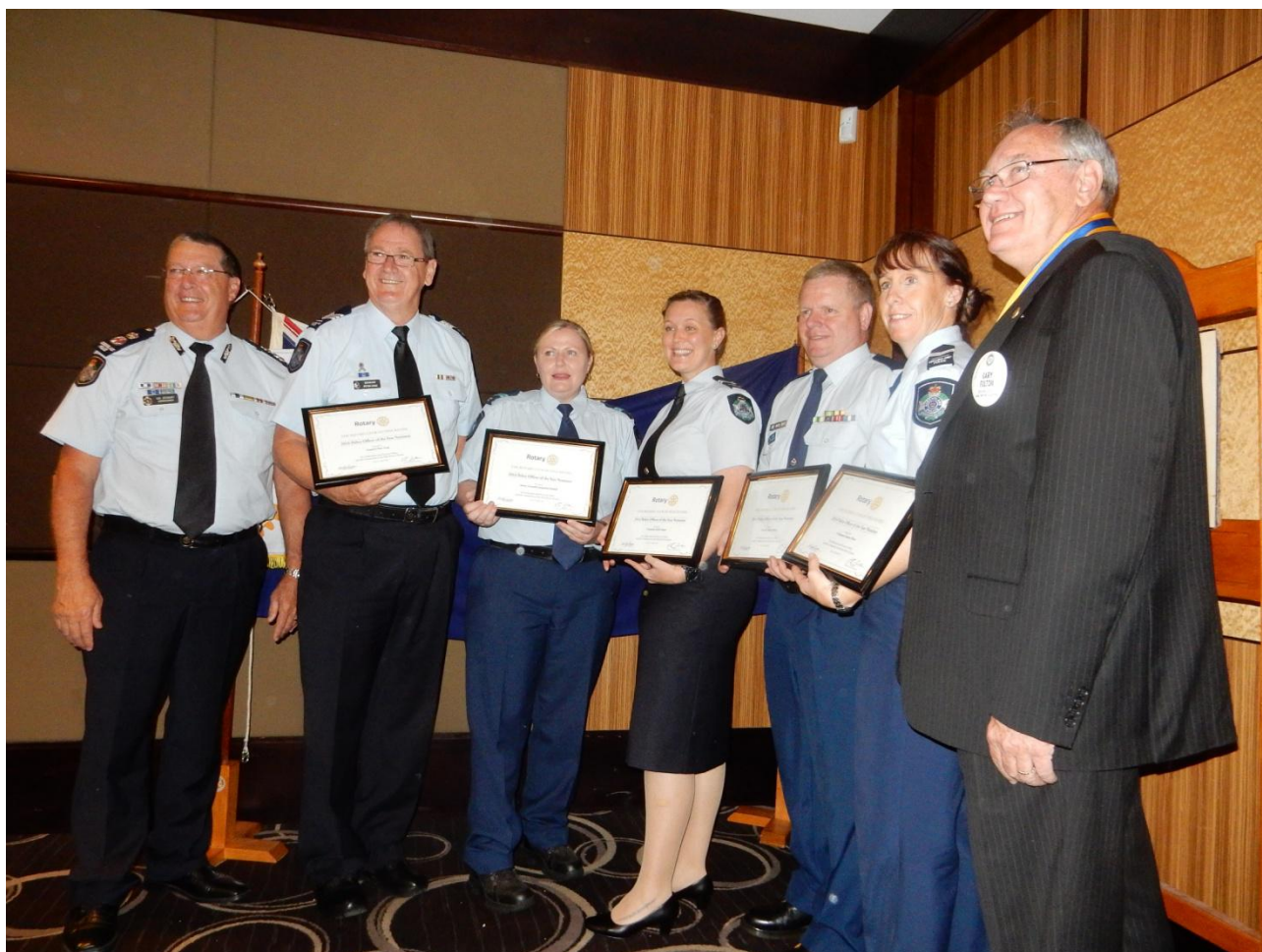
The Police nominees and their certificates