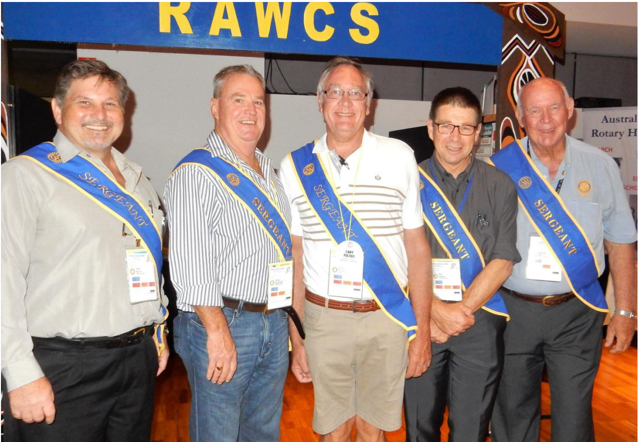
District Conference Sergeants and their new sashes