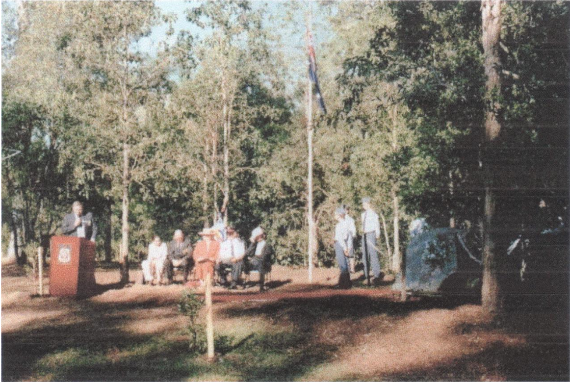
The dedication ceremony for the Spitfire memorial was a moving tribute to Servicemen.

In 1995, the M.O.W. Committee upgraded the kitchen. It is now a most modern stainless steel kitchen with modern appliances. Under the guidance of Mrs Lyn Bailey, it is held as a model kitchen throughout Queensland, not only because of the facility, but also because of the high standard of meals served and the well-organised delivery service, delivering hundreds of meals each day.