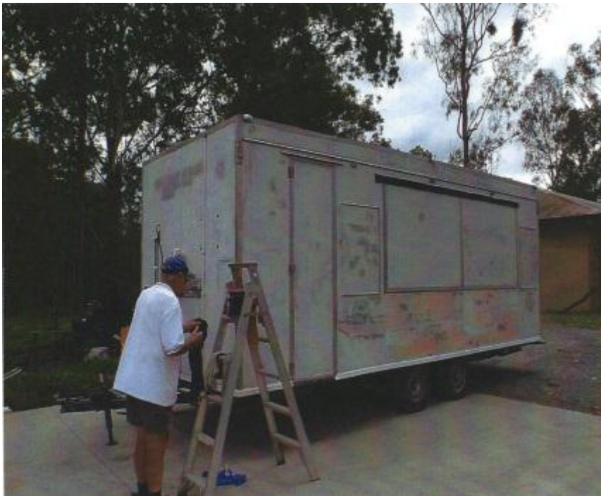
The van gets a makeover